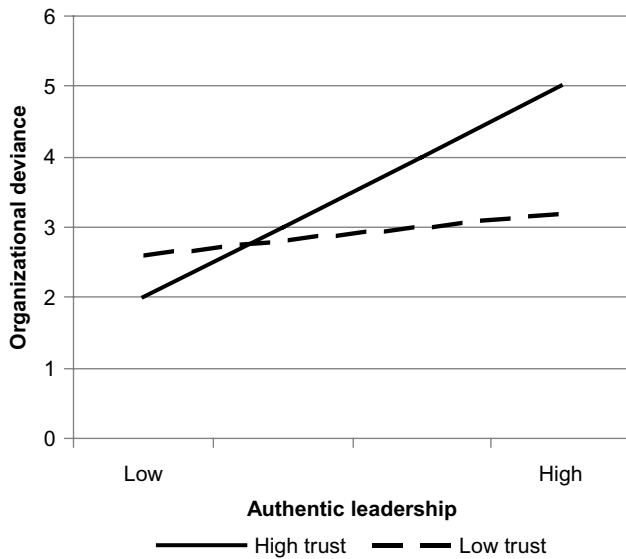
Figure 1. Interactive effects of authentic leadership and trust on organizational deviance