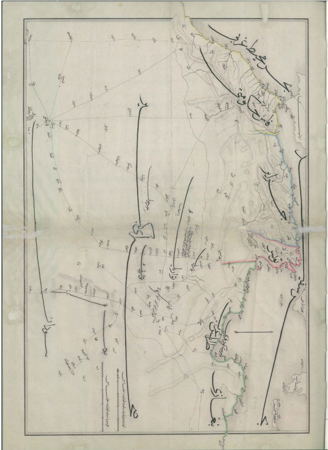
Figure 4: The Ottomans in Africa