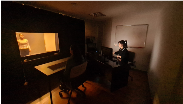
Figure 2: The participant area displays the participant observing the human actor through the OLED screen and the experimenter monitoring the process.