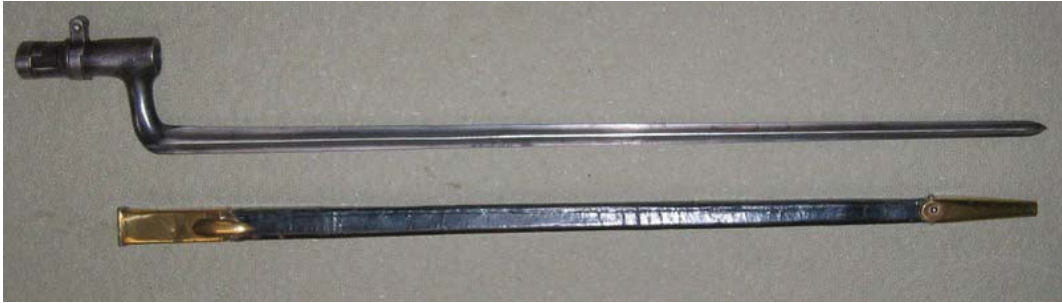
Fig. 5. A Peabody-Martini socket bayonet and scabbard.