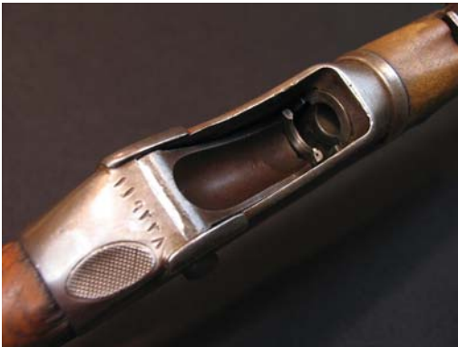
Fig. 12. The new serial marking on the breech block of a post-1910 converted Peabody-Martini Rifle.