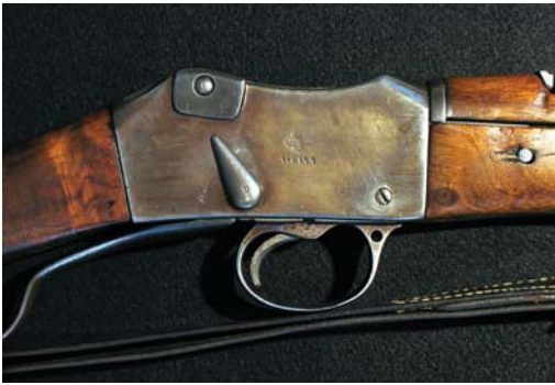
Fig. 10. The right hand side of a receiver converted to the Mauser 7.65 × 53 cartridge, showing the strengthening plate added to the rear of the breech system.