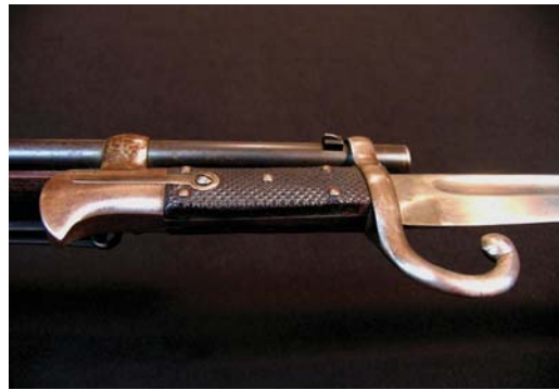
Fig. 7. Side view from the right of a Peabody-Martini Rifle with yataghan bayonet fixed to the bayonet tenon on the top barrel band.