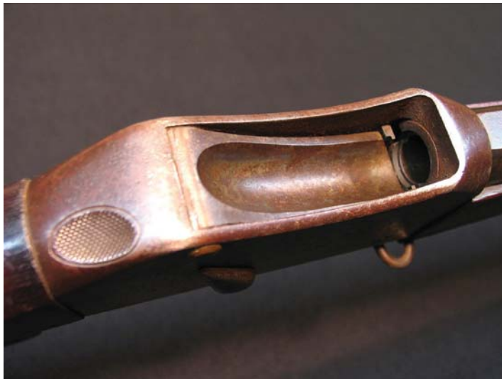
Fig. 4. A Peabody-Martini breech block opened for loading, showing also the chequered thumb rest characteristic of the Martini-Henry Mk. 1 Rifle.