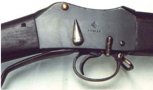
Fig. 2. The right side of the receiver of a Peabody-Martini rifle showing the tughra and serial number, and safety catch in the trigger guard, eliminated after 1876.