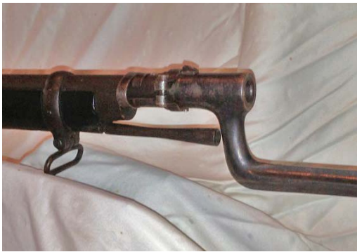
Fig. 6. An early production Peabody-Martini Rifle with socket bayonet fixed, demonstrating the novel under the muzzle placement shared with the Dutch Beaumont Model 1871 rifle as opposed to the usual right-hand side position of such bayonets.