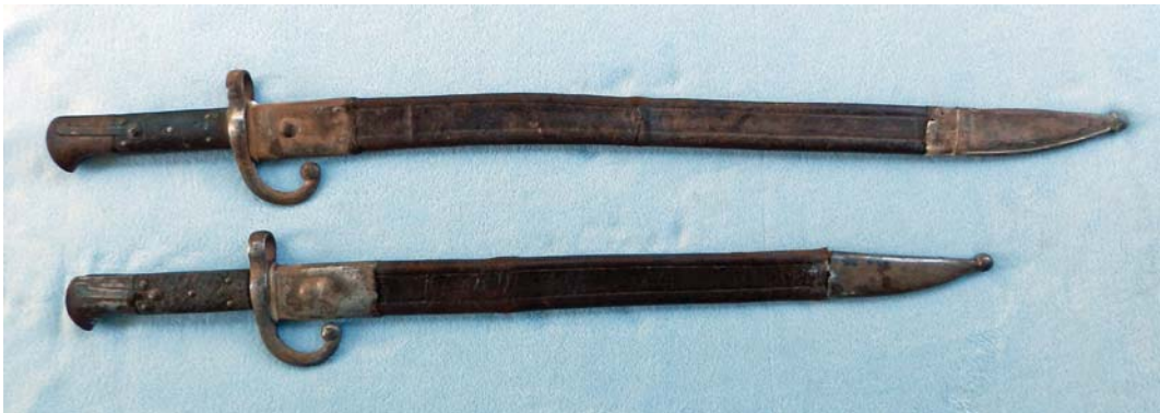
Fig. 8. Peabody-Martini yataghan bayonets in their scabbards as seen at the Ankara Antika Pazarı, the top one an original length version, with a repaired chape, the bottom one a shortened and straightened version.