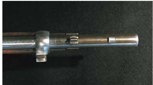
Fig. 13. View from above of the muzzle of a converted Peabody-Martini rifle with stud for fitting a socket bayonet and top barrel band with a bayonet tenon (lower left) for fitting a yataghan bayonet (photograph courtesy of J.P. Sheehan).