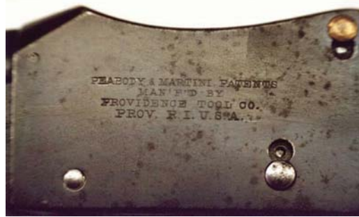
Fig. 3. The left side of the receiver of a standard Peabody-Martini rifle, with the maker's mark.