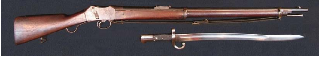
Fig. 1. A standard Peabody-Martini Rifle, shown here with a bayonet tenon on the top barrel band and yataghan-style bayonet as introduced with the final 200,000 versions of the rifle.