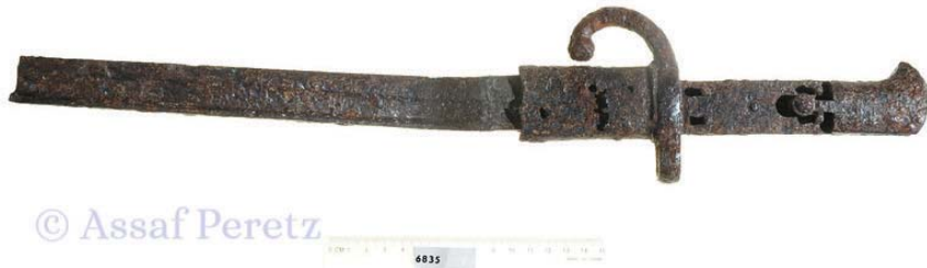
Fig. 15. The remains of a standard Peabody-Martin yataghan bayonet and its surviving steel locket from its leather scabbard found in the remains of the Arab village of Qaluniya, an Ottoman outpost in World War One (photograph courtesy of Assaf Peretz, and Shua Kisilevitz and Anna Eirikh-Rose of the Israel Antiquities Authority).