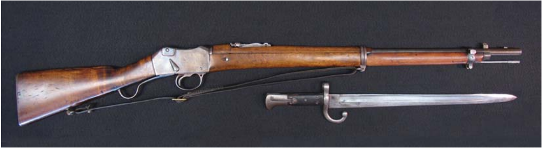
Fig. 9. A post-1910 Peabody Martini Rifle as chambered for the standard Mauser 7.65 × 53 cartridge, with the shortened barrel, 'Turkish Model' 1903 woodwork, alongside a straightened yataghan bayonet associated with this firearm.