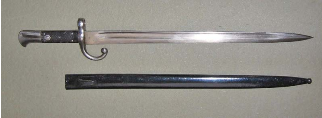
Fig. 14. A shortened Peabody-Martini yataghan with a steel scabbard.