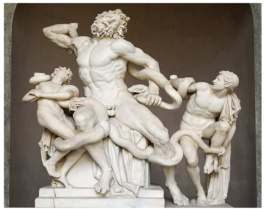
Figure 4.1 An example to moral and educative intentions of the ethical regime of images. Laocoön and his sons , Hellenistic original. 200 BC

Therefore, the story becomes the most important part of an art form. The representational regime of art values the characters and the general narration of the art work, which includes the stories of the characters. In this regime a story can be told via various different artistic forms. Therefore, the essence of the poem is the story it tells, not the use of the language. Rancière (2009) highlights that "Insofar as it is seen as the mere accomplishment of a religious or therapeutic ritual dance is not an art ... Something else is required to be counted as an art. This something else was, until Stendhal's time, called a story" (p. 6). In Rancière's terminology mimesis is the synonym of representation. The representative regime of the arts, which consists of threefold relation: mimesis , poetics and aisthesis . Rancière states that it is mimesis which distinguishes the artist's know-how from artisans and entertainer. He continues "Fine arts were so named because the law of mimesis defined them as a regulated