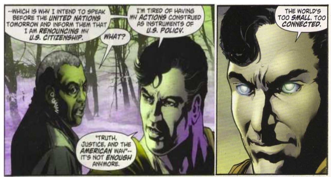
Figure 1.1. Superman declares that the world is too small and connected. Action Comics #900