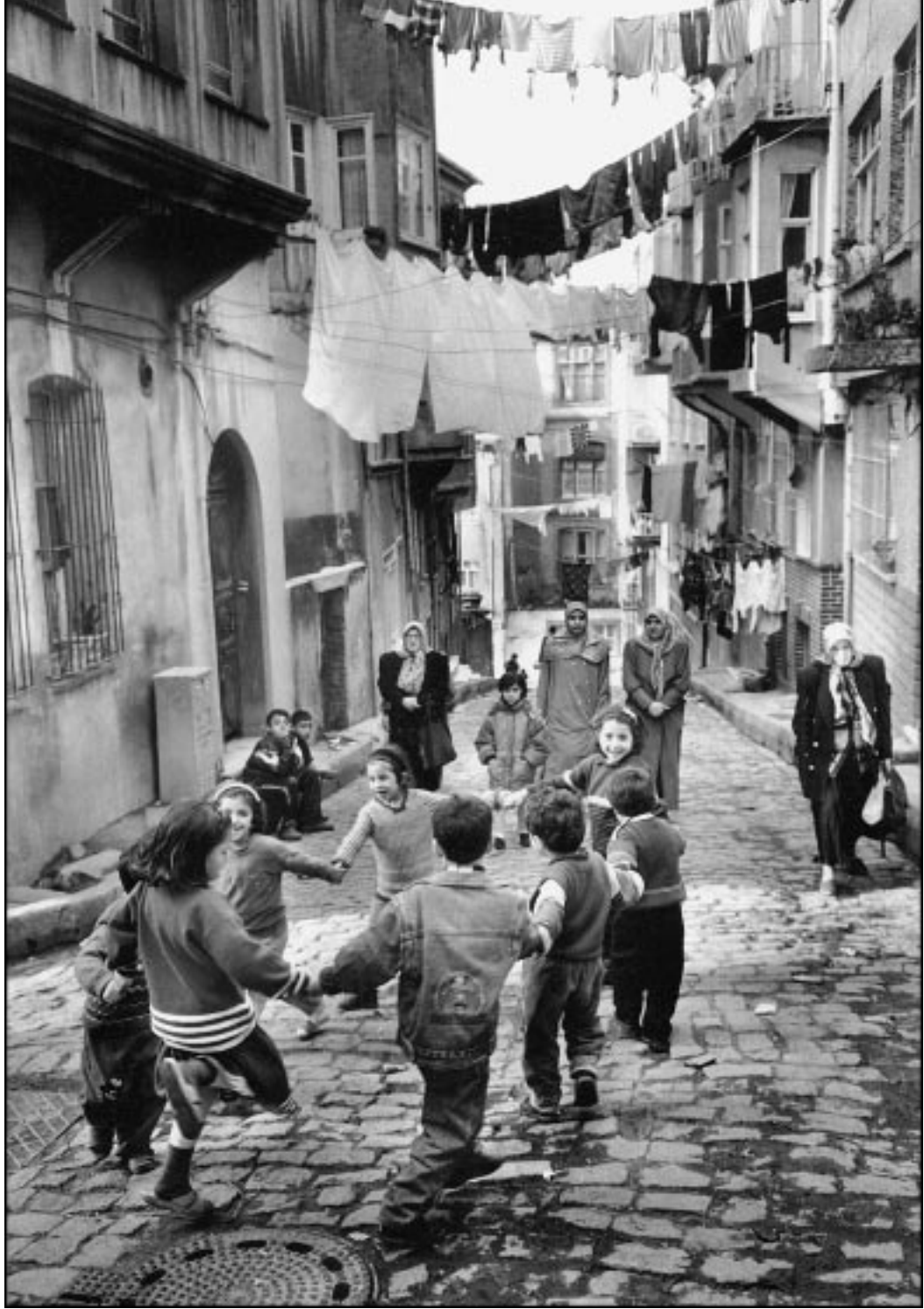
Street scene from the old quarter of Istanbul, 1996.