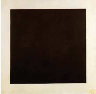
Figure 5: The Black Square.

https://upload.wikimedia.org/wikipedia/commons/f/f7/Black_square_lg.jpg (accessed September 1, 2019).