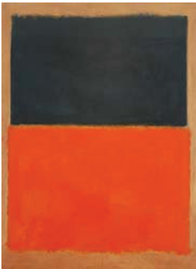
Figure 2: Green and Tangerine on Red.

https://www.phillipscollection.org/research/american_art/artwork/Rothko-Green_and_Tangerine.htm . Accessed September 1, 2019.