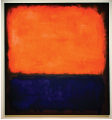
Figure 3: The Number 14 (1960).

http://redtreetimes.com/tag/mark-rothko/ . Accessed September 1, 2019.