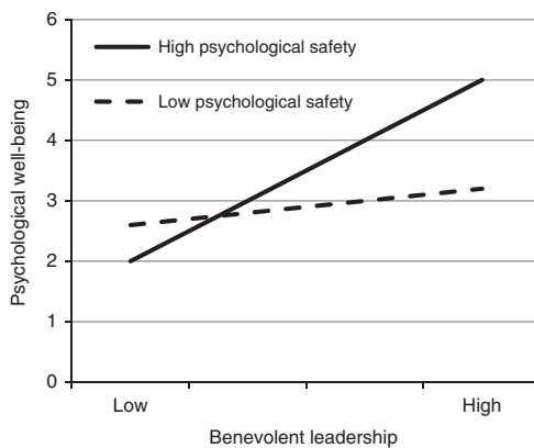
Figure 2. Interactive effects of benevolent leadership and psychological safety on psychological well-being

The results in this study suggest that researchers should continue to investigate psychosocial and contextual factors such as person-job fit (Vigoda-Gadot and Meiri, 2007), organization structure and size (Perry et al. , 1994), organizational politics (Davis and