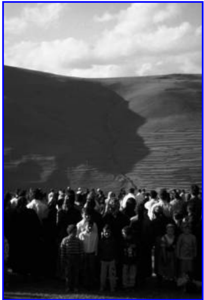
Figure 2. Celebrating the appearance of Atatürk’s shadow in Damal.

The newly popular and commercialized Atatürk paraphernalia is significantly different from the gigantic and naturalized representations discussed above. Most often, such material takes miniature forms, for example, as pins, crystal ornaments, and small pictures. As opposed to traditional representations, which occupy public places owned by no one (and, thus, owned only by the state),