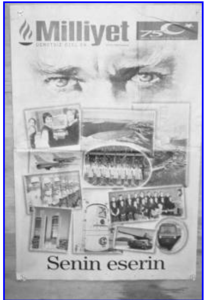
Figure 4. Cover of Milliyet on October 29, 1998. The caption reads “Your product.”