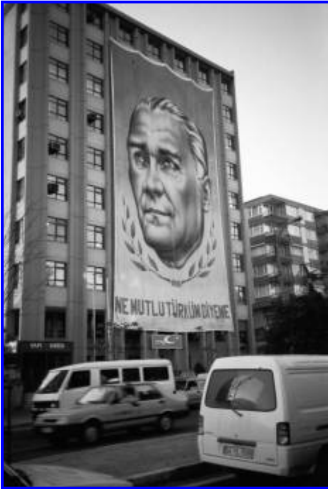
Figure 1. An Atatürk portrait hung on a government building in Istanbul in 1998. The caption reads “Happy is the one who says I am a Turk.”

beyond ordinary humans. 10 Even today, the Turkish army covers the mountain slopes with giant pictures and sayings of Atatürk, such as “Happy is the one who says I am a Turk.” The production of such paintings increases at times of political crisis.