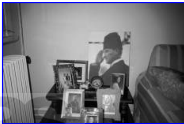
Figure 3. A "mini giant" Atatürk placed among family pictures.

The contrast between the gigantic and miniature representations of Atatürk in the late 1990s was not limited to