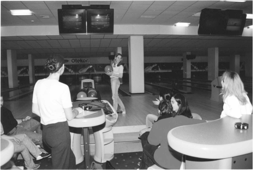
Figure 4. Female group bowling at the recreation center.

either a liked or a disliked feature. The student finds the mall users 'high quality'. The high school graduate finds other people interesting and different and likes to watch them. The worker likes the ambience, but finds everything expensive, and likes to gaze at other users. Although the scope of these interviews is limited, it seems that younger people seem to be less tolerant of 'different others'.