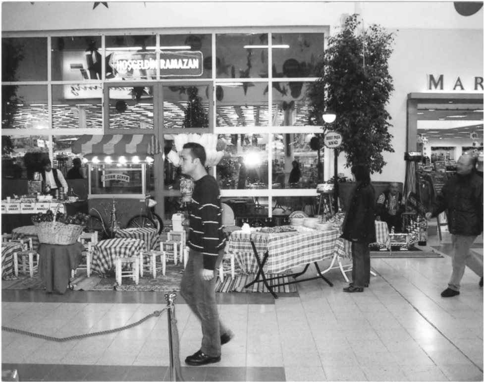
Figure 3. Temporary Turkish coffeehouse next to Marks and Spencer (by Kenan Ozduran).