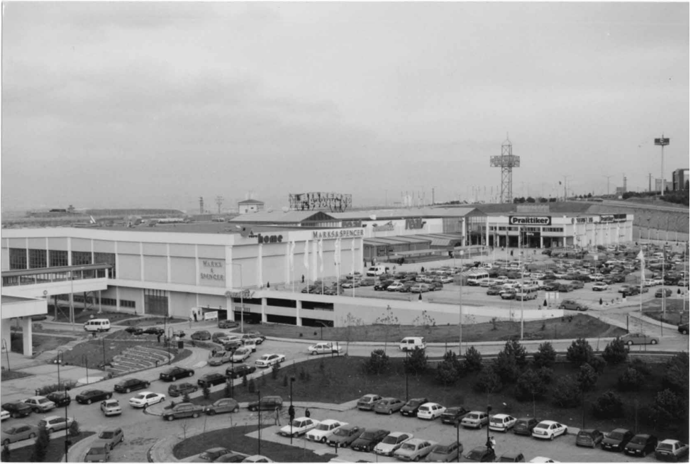
Figure 2. General view of the Bilkent Center.

However, seeing the future of the construction sector in Turkey and the global influences that are particularly influential upon the lifestyle of the well-off, developers decided to add a larger extension which is now used by Real and Praktiker, hypermarkets owned by German capital through Metro AG. Within this part, there is a small food court and small shops selling the products of international brands such as Sauder, Camel, etc. International fast-food chains serve food side by side with Turkish food chains selling traditional Turkish deserts and beverages. A dry-cleaning service is provided by Dryman. Similarly, Handyman in Praktiker provides transportation and interior-decoration services. The interesting point is that Handyman is a Turkish company, owned by Turgay Insaat, with an English name. Such fashionable use of English titles is also noted by Abaza (2002) in the Egyptian case. In addition, Marks and Spencer, Toys R Us, and Burger King are located within the center as well as an international movie theater—Cinemaxx. A huge home store owned by Tepe is another important attraction for consumers. Now, the overall shopping area is more than 60 000 m 2 (Soysal, 2001).