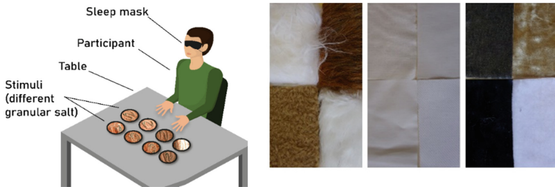
Fig. 1. Illustration of the setup and an example material set (i.e., granular material: salt) in the experiment. A blindfolded participant explores salt in different levels of granularity. Samples of fur, cotton, and velvet used in the experiment (right).

material. High-scoring materials for each dimension were as follows; granularity: salt and sand; viscosity: hand cream and hair gel; surface softness: velvet, fur, and cotton; deformability: therapy dough and custom-made silicone rubber stimuli, (see [2, 3] for some examples). For each material we selected several exemplars with different levels of main dimension feature (e.g., varying granularity of salt, by varying grain size). We intended to collect as many feature levels as possible within each material class which resulted in unequal number of levels across materials. We either created or purchased (if commercially available, see Appendix A Table 1.) the materials in different levels. Our aim was to create materials which lie along the four different dimensions and are discriminable from each other. To this end, we formed an initial material set based on our own perception, and piloted the materials to check whether the intermediate levels could also be distinguished by others. If some steps were indistinguishable we increased the differences between stimuli (e.g., adding more water to diluted hand cream). The proper experiment here, then served to corroborate the piloting results for a representative sample and to test the correlation with softness judgments.