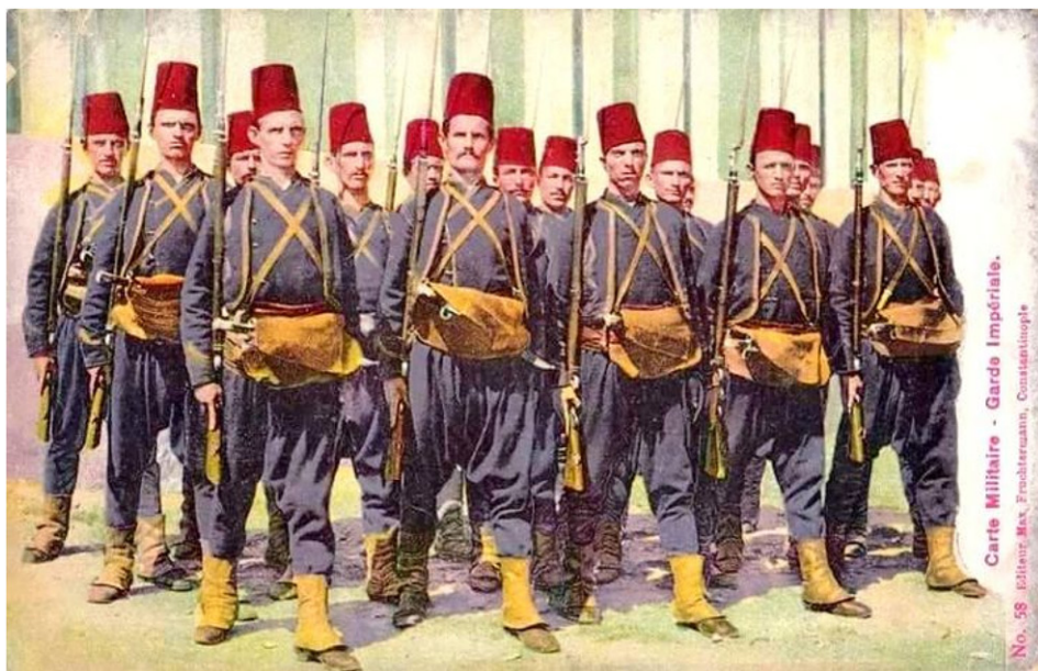
FIGURE 22. Post card of the Albanian battalion of the Imperial Guard, with socket bayonets fitted to their Peabody-Martini Rifles, and yataghan bayonets in their bensilanar.