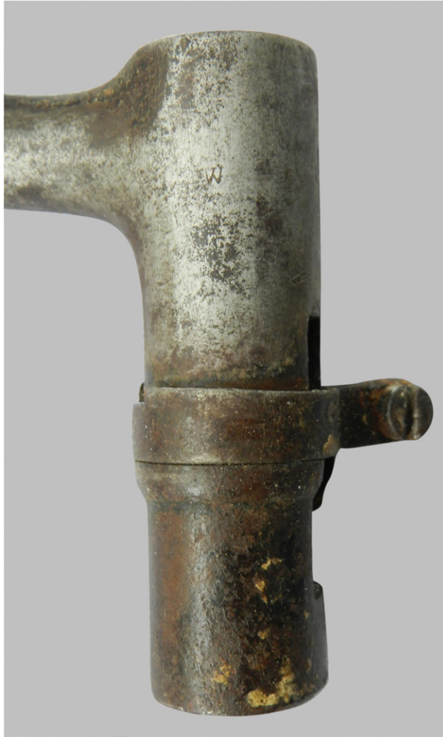
FIGURE 14. Inspection letters 'W' and 'C' on a Peabody-Martini socket bayonet.

though, and in fact even disagree as to the difficulty or otherwise of repairing the more usual triangular-sectioned bayonet wound. 45 On the other hand, it might simply be that this 'blade' form, with the flutes serving akin to the 'I' form of a steel girder, resulted in a stronger weapon than a bayonet of the same weight and more usual flattened triangular style found normally with socket bayonets, reducing the risk of the blade breaking if used too vigorously. Hence also, we might assume, the all-steel construction for the Peabody-Martini socket bayonet as opposed to the common method of brazing a steel blade to an iron socket, so eliminating the danger that the blade might snap off at the junction, although the Remington export quadrangular-