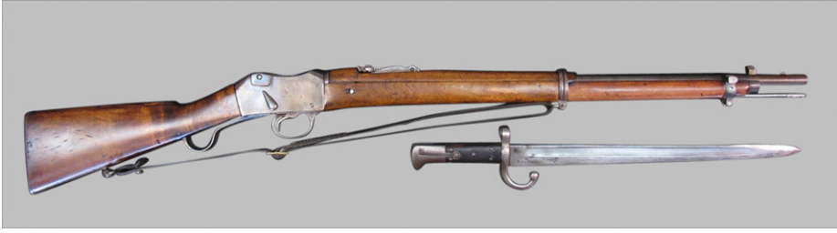
FIGURE 7. A post 1911/1912 converted Peabody-Martini Rifle, fitted for the 7.65 \times 53R cartridge, with the shortened yataghan bayonet associated with this model, and the lug in front of the foresight for fitting a socket-bayonet in place of the yataghan-style bayonet.

known dates indicate the process lasted from at least 1912/1913 to 1915/1916, 35 with a fresh serial number being applied to the back of the breech mechanism (Figure 10).