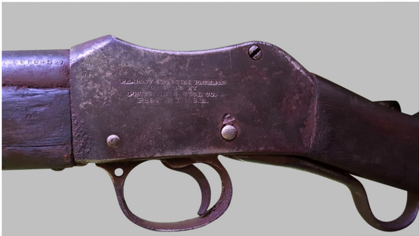
FIGURE 4. Left-hand side of the receiver on an early production Peabody-Martini, showing the makers mark.

‘Turkish’ Model 1890, 1893 and 1903 rifles. 32 The conversion process involved truncating the original breech blocks for a new extractor and fitting a newly made shorter barrel of around 29.13 inches (74 cm), these being made between October 1910 and March 1911 by the Österreichische Waffenfabriks-Gesellschaft at Steyr. 33