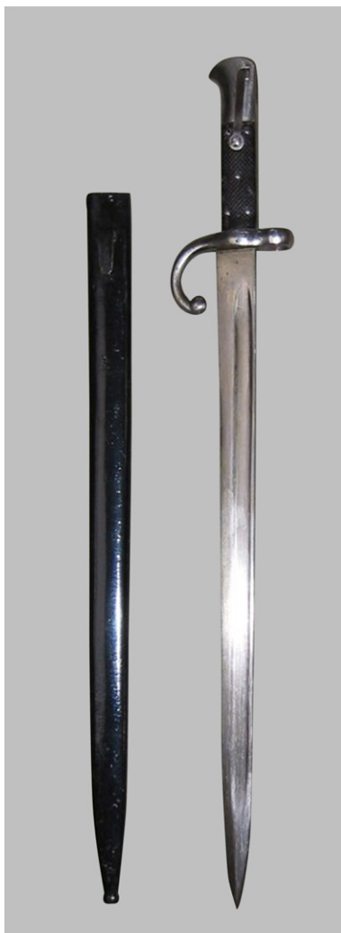
FIGURE 19. Shortened Peabody-Martini with steel scabbard.

These bayonets were usually housed in a shortened version of the original scabbard (e.g. Figures 6 and 15), although one reported example has a squared-off chape in the manner of a Mauser Model 1887 scabbard, and purpose-made steel examples with straight sides are known (e.g. Figure 19). The procedure involved in producing these weapons was evidently to cut through and dispense with the last 4 inches (10.5 cm) of the original blade at a point just beyond where the fullers ended, followed by hammering flat and shaping a new point, then grinding out the bottom edge of the blade. The result was to give the weapon a straightened appearance, although a ruler placed along the blade spine reveals that few are anywhere near exactly straight. 61