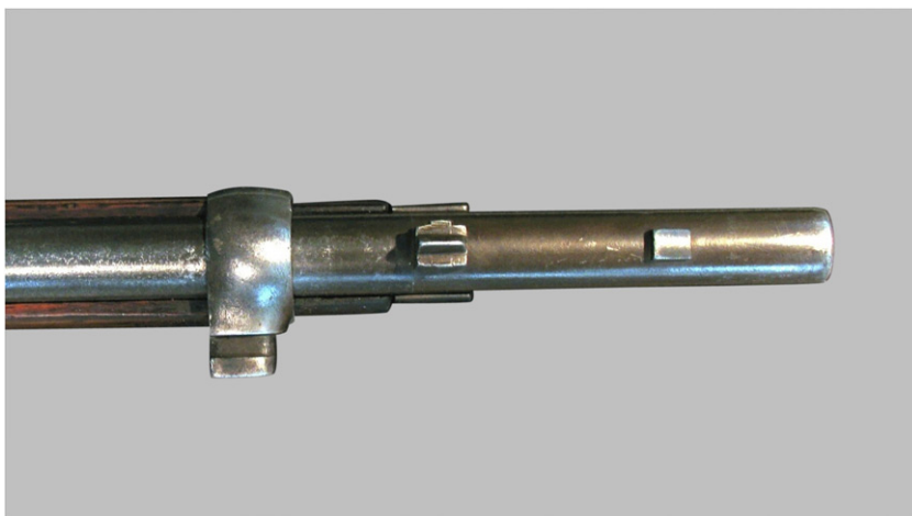
FIGURE 8. Detail showing the bayonet bar, foresight, and socket bayonet lug on a post-1911/1912 converted Peabody-Martini Rifle.