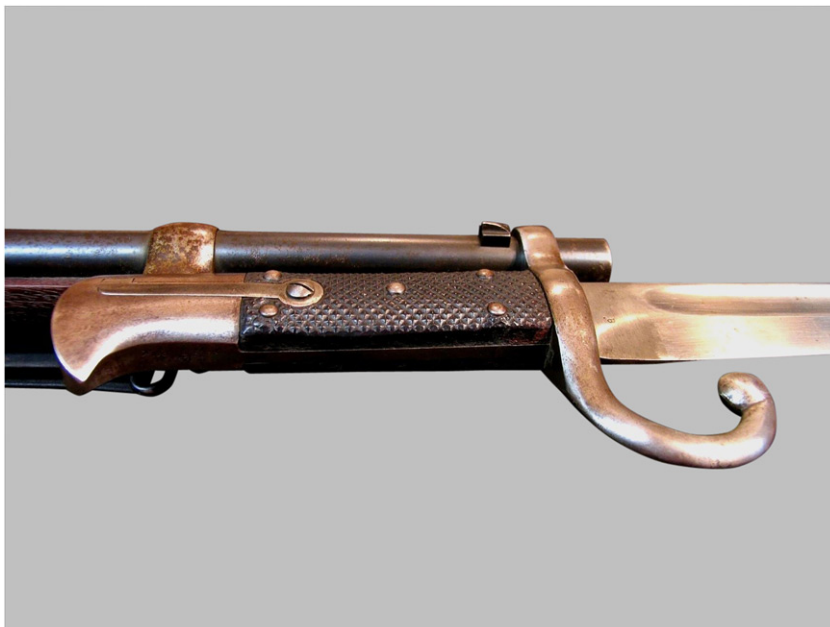
FIGURE 6. Detail of the yataghan bayonet fitting on a post-1875 Peabody-Martini, Rifle (photograph supplied by John P. Sheehan).

The result was a rifle with an overall length of 45.5 inches compared to the 49 inches of the original, the barrel being the same diameter as the original Peabody-Martini Rifle so as to fit the existing stocks of Peabody-Martini socket and sword bayonets. This meant fitting a socket bayonet lug where the foresight on the original rifles was, the new foresight being set slightly back from this above the top barrel band and its bayonet lug. Moreover, as we will see, many of the existing sword bayonets were now shortened to maintain balance (Figures 7 and 8). The conversions, which were somewhat heavier at around 9 pounds 4 ounces (4.20 kg) than the original rifles, were stamped on the left-hand side of the receiver with an Ottoman text beneath the existing Peabody-Martini markings, this reading in translation ‘Tüfenk Fabrikası/İstanbul/year of XXXX’, Persian-style numbers being used to indicate the year the conversion took place according to the Rumi or financial calendar (Figure 9). 34 The