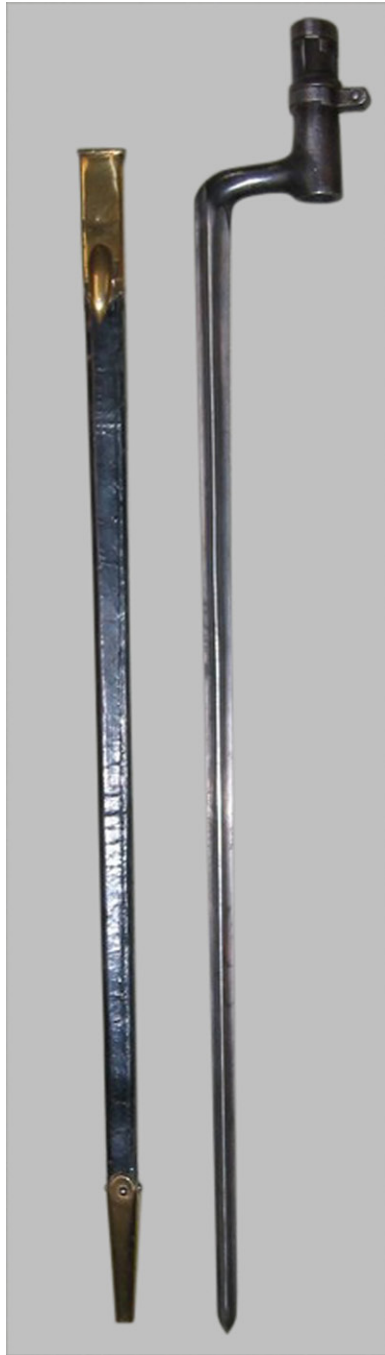
FIGURE 13. A Peabody-Martini socket bayonet and scabbard.