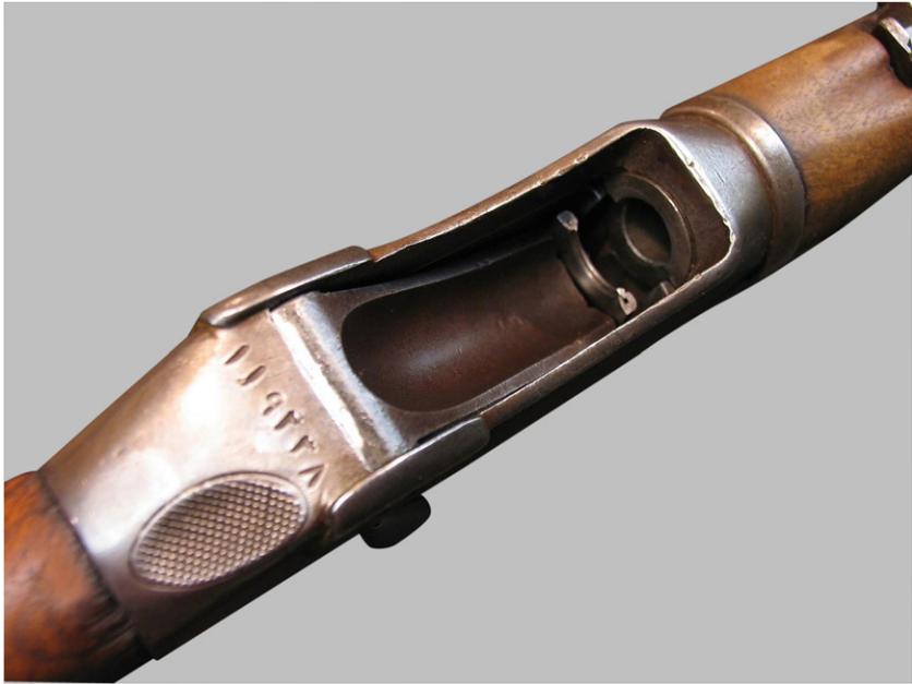
FIGURE 10. Detail of the breech assembly of a post-1911/1912 converted Peabody-Martini Rifle, with the serial number 119237, and showing the chequered thumb rest copied directly from the original pattern model for the Peabody-Martini Rifle.

We will return to these matters and others below, but first a short description of the Peabody-Martini socket bayonet and its scabbard, which in most other respects matches those of most other contemporary weapons of this type (e.g. Figure 13 ). That is to say, it has an overall length of 23.25 inches (59.1 cm), and was attached to the rifle via a 3.15 inch (8 cm) long socket, with a 0.79 inch (2 cm) external diameter and 0.69 inch (1.75–1.82 cm) bore, and a Z-shaped fitting slot, a tension band with a single tightening screw helping to secure the bayonet in place on the barrel. The quadrangular-sectioned ‘blade’ is 20.125 inches (51.4 mm) long, with a 0.7 inch (1.8 cm) diameter near the elbow, gradually tapering to 0.35 inch (0.9 cm) diameter just before the quadrilateral point, and weighs 14 oz. (398 gr). When not fixed to the rifle the bayonet was housed in a black leather square-sectioned scabbard with a brass locket fitted with a tear-shaped frog stud and a square-ended brass chape.