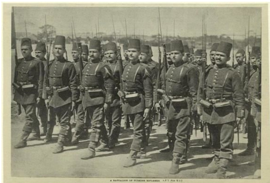
FIGURE 11. Newspaper photograph of about 1880 of an Ottoman Infantry unit with socket bayonets fitted to their Peabody-Martin Rifles.

infantry of this style bayonet and others of sword-type, such forms having previously been restricted generally to artillery and engineer units for clearing brushwood and the making of fascines, etc. But what is unusual about the Peabody-Martini socket bayonet is the choice of a quadrangular-section ‘blade’ instead of the flattened triangular form commonly used for socket bayonets since about the beginning of the eighteenth century. The choice of this form was probably directed by the Providence Tool Company which had supplied a bayonet of this type with the Peabody Model 1866 Rifles sold to the Swiss Army in 1866 and 1867. 43 However, socket bayonets with a quadrangular-section were highly unusual at this or any other time. Indeed, after its introduction with the Austrian Lorenz rifle of 1854, the form was adopted by few other European armies, namely by the Swiss (with the Model 1863 Infanteriegewehr , the Peabody Model 1866 Rifle, and the Vetterli Model 1871 Repetierstutzeri ); by Sweden (the Remington Rolling Block Model 1867); by the Netherlands (the Beaumont Model 1871); and by Russia (the Berdan Model II 1871).