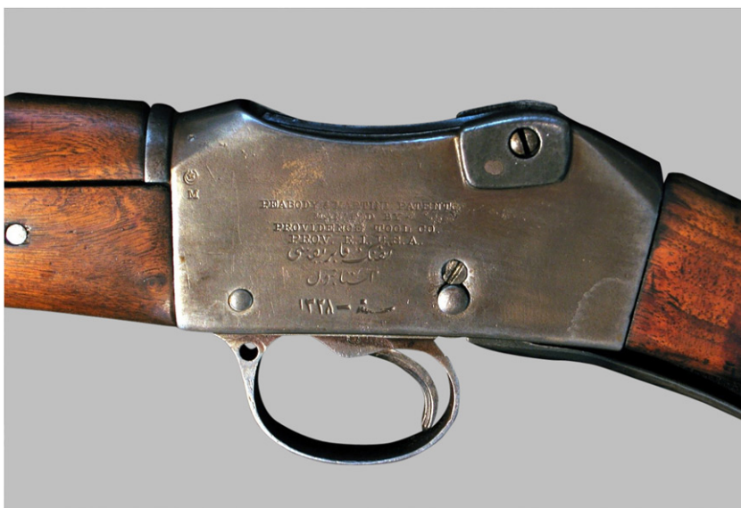
FIGURE 9. Left-hand side of a post-1911/1912 converted Peabody-Martini Rifle, dated to 1327 = 1912/1913, with the strengthening plates added at the back of the chamber.

identification of a small number of all-steel socket bayonets as made for the Peabody-Martini Rifle as except for a rare few with single letter ‘inspection marks’, none of the identified examples have any other form of marking, either a maker’s mark, or a serial number, or even as might be expected some indication of Ottoman ownership. 42