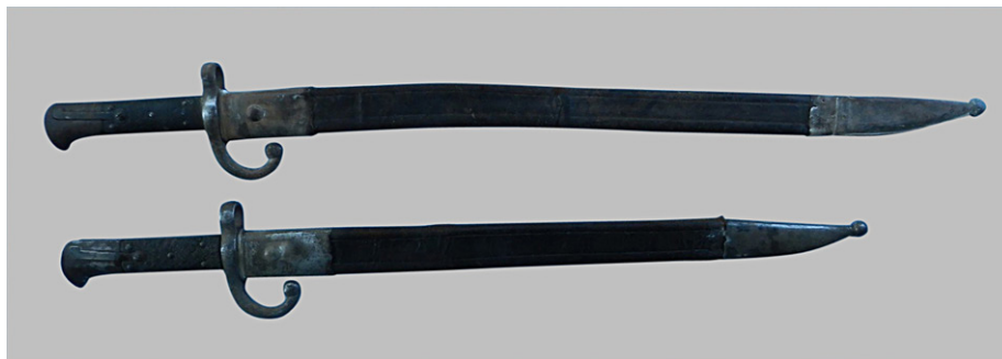
FIGURE 16. Examples of a full-length and shortened Peabody-Martini yataghan bayonets in their scabbards, the full length one showing a repaired shape.