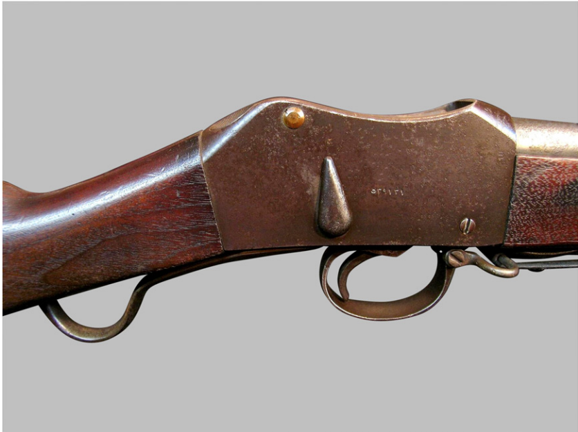
FIGURE 3. Right-hand side of the receiver on an early production Peabody-Martini, showing the tughra and serial number, in this case 539121.