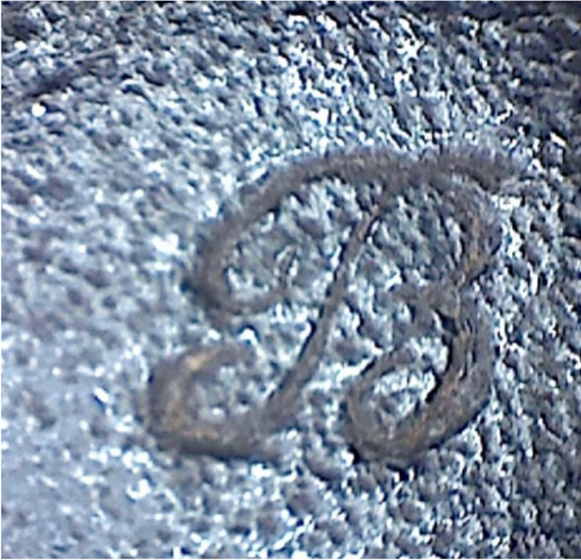
FIGURE 18. Detail of scabbard marking beneath the locket on the top scabbard in Figure 15.

adopting this style of bayonet, when fixed to the rifle, its' all-steel construction, and length and weight made for a significantly heavier and longer weapon all round, the Peabody-Martini Rifle with fixed yataghan bayonet having a weight of about 10 pounds 8 ounces (4.87 kg) and a total 'reach' of about 6 feet (181.6 cm). How this may have affected individual marksmanship skills at close range must remain a matter of speculation, although as was demonstrated at the Siege of Plevna, high trajectory plunging volley fire was a favoured Ottoman infantry tactic, and proved exceedingly effective at a range of up to 2000 or so metres.