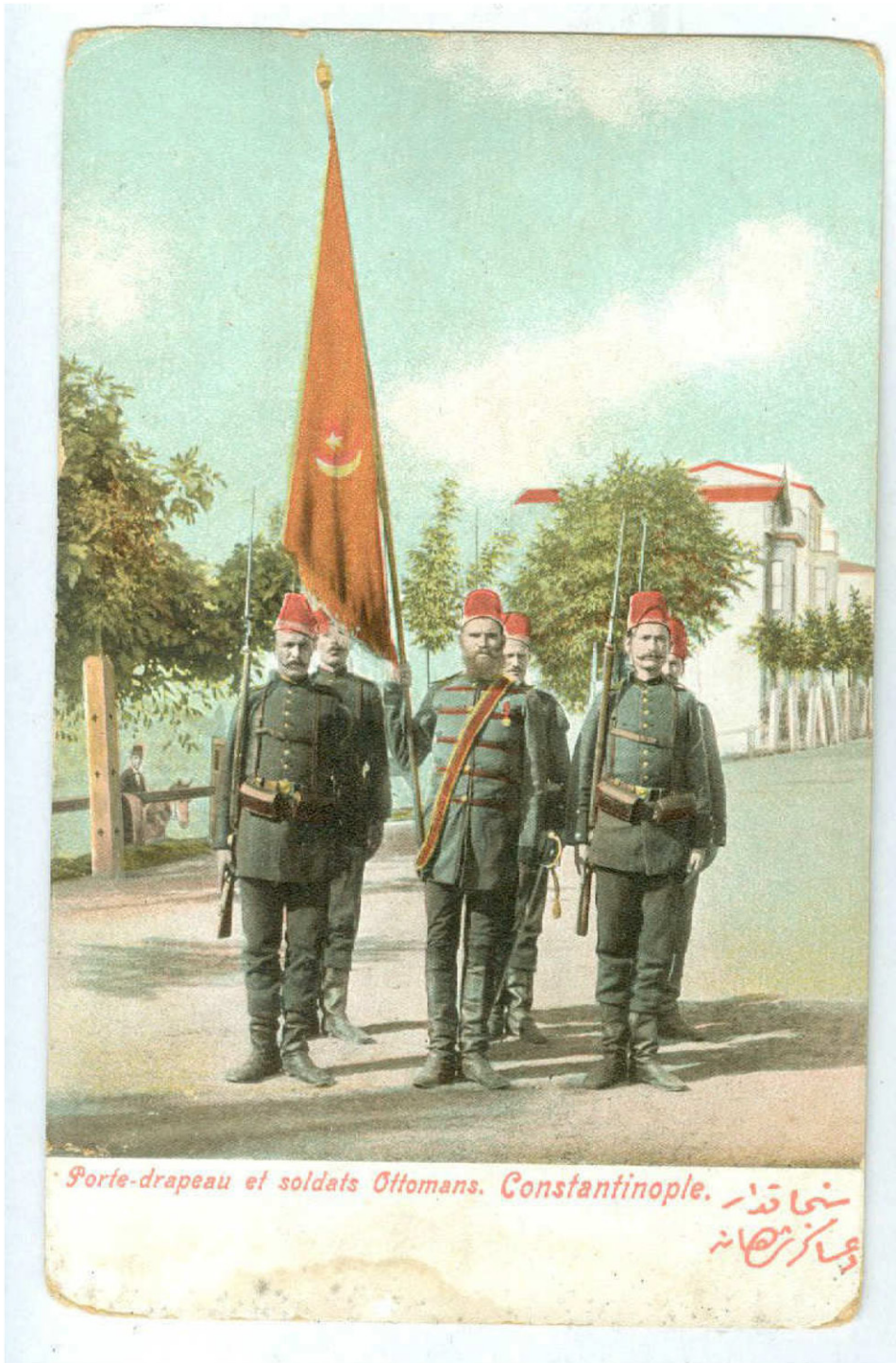
FIGURE 12. Postcard of about 1890 showing the Colour Guard for an infantry battalion, with soldiers carrying the Peabody-Martini and fixed socket bayonet.