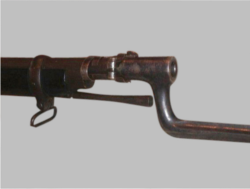
FIGURE 2. Detail of the socket bayonet as fitted to an early Peabody-Martini Rifle.

made after 20 November 1876. By that time 369,000 rifles had been completed to the original specification, 12 these now being known to collectors as the ‘Type A’, those without being classed as ‘Type B’. 13 However, while maintaining the same barrel diameter and 49 inches (124.5 cm) overall length as the Martini-Henry, the Peabody-Martini Rifle was—as stipulated by Constantinople—chambered for a 11.43 × 55R Berdan-type cartridge instead of the British .577-450 ‘Boxer’, and fitted with a 1200 metre rear sight graduated in Persian-style numbers. 14 Moreover, while the Martini-Henry Mk.I ‘Second Pattern’ could be fitted with either a socket or a sword-type bayonet, with the blade resting along the right side of the barrel, 15 all Peabody-Martini Rifles made for the first contract and most for the second took a socket bayonet only fitted below the barrel (e.g. Figure 2). Finally, all Peabody-Martini Rifles were engraved on the right-hand side of the receiver with the tughra or monogram of the reigning Ottoman sultan—Abdül Aziz (1861–1876) for the first contract, Murad V (1876), and Abdülhamid II (1876–1909) for the remainder—and a serial number using Persian-based Turkish numerals, the left-hand side being stamped ‘PEABODY & MARTINI PATENTS [or PATENT]/MAN’FED BY PROVIDENCE TOOL CO./PROV.R.I. U.S.A’ (Figures 3 and 4).