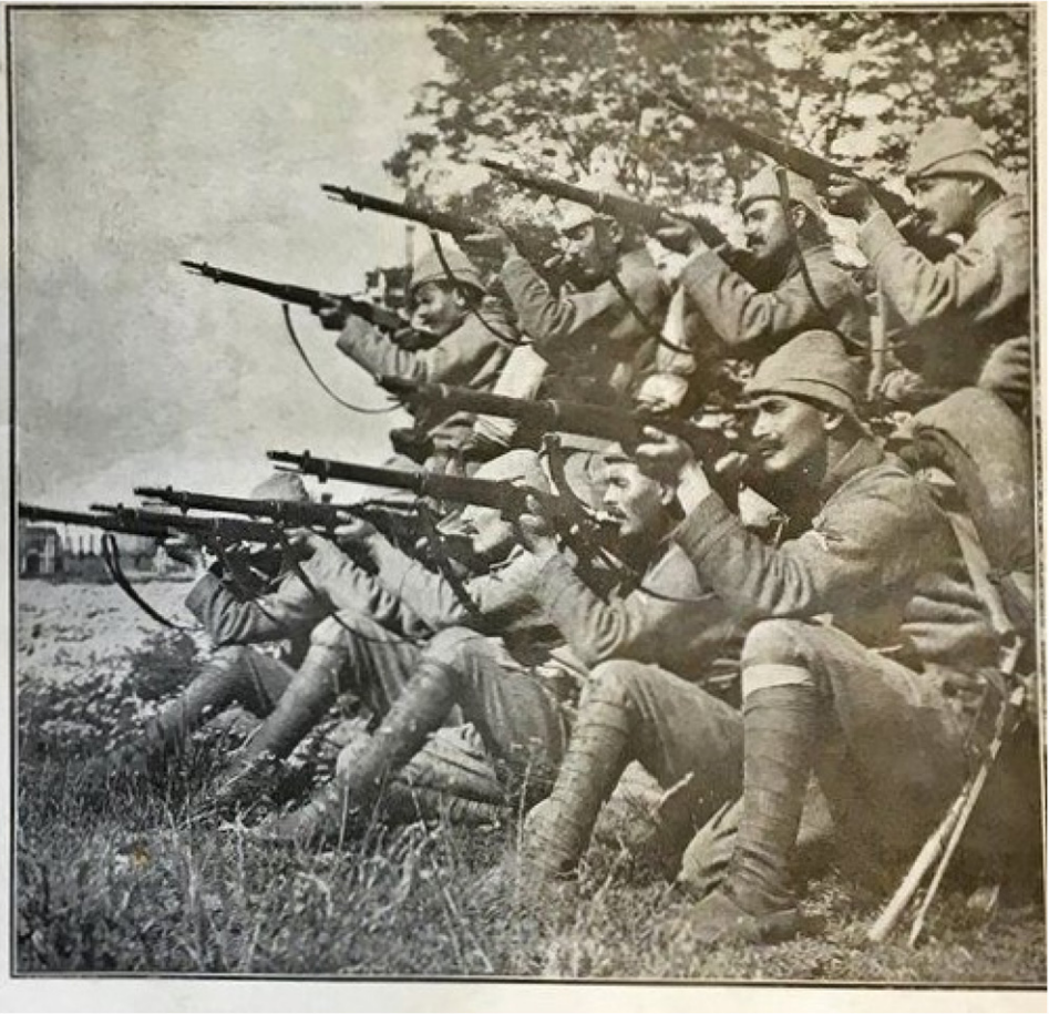
FIGURE 20. Illustration from the front cover of the Ottoman magazine ‘Harp Mecmuasi’ dated Mayıs 1332 (May 1916).

As we have seen, when it was decided to convert at least 173,778 of the ‘obsolete’ Peabody-Martini Rifles to fire the Mauser 7.65 \times 53 cartridge the Ottoman powers that be—fully wedded to the principle of ‘waste not want not’—insisted the new barrels be tailored to fit the original Peabody-Martini bayonets to allow their continued use. 62 As the ‘new’ rifle was 44.8 inches (114 cm) long overall, almost a full 5 inches (12.7 cm) less than the original, it seems logical to associate these shortened yataghan bayonets with the introduction of the shorter rifle, so giving an Ottoman infantryman a weapon that, with bayonet fixed, weighed about 11 pounds (5 kg), and measured some 5 feet 1 inch (166 cm) overall butt to blade point.