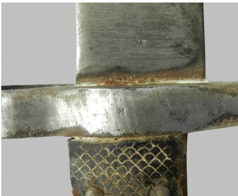
FIGURE 17. Inspection marks 'W' and 'H' on a Peabody-Martini yataghan bayonet.

cavalry and artillery units being issued with these on account of their need for a bayonet that could be used mainly as a side-arm, as a cutting weapon if needs be, but which could in extremis might also be used as a thrusting weapon when affixed to a rifle. 59 We have, unfortunately, no clear evidence regarding which units of the Ottoman army were issued with the Peabody-Martini yataghan bayonets except that they were certainly supplied to the light infantry Tallia or Chasseur battalion attached to each Ottoman regiment. 60 Be that as it may, whatever the reason for