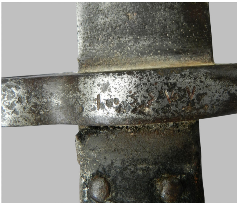
FIGURE 21. Serial number 104477 on a shortened Peabody-Martini bayonet

explicit evidence to support the idea. For example, it is clear that some troops supplied with the converted rifle used socket bayonets (Figure 20). 64