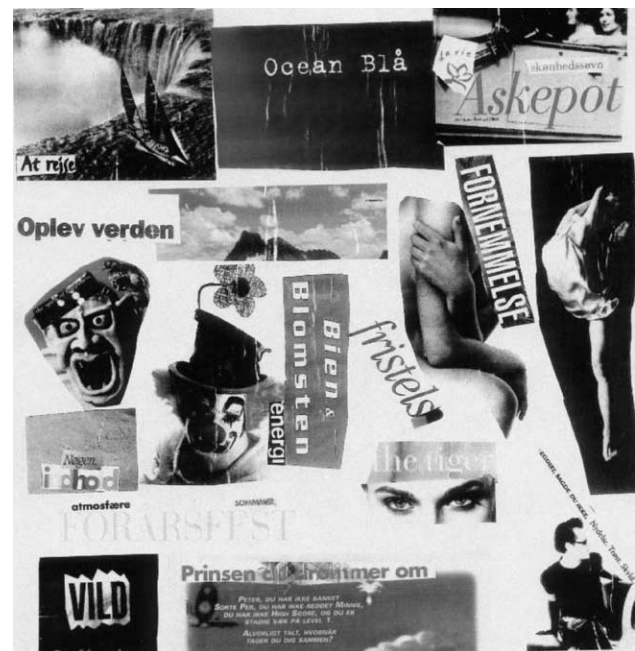
FIGURE 4 DANISH FEMALE DESIRE COLLAGE

NOTE.—See the electronic edition of the journal for a color version of this figure.