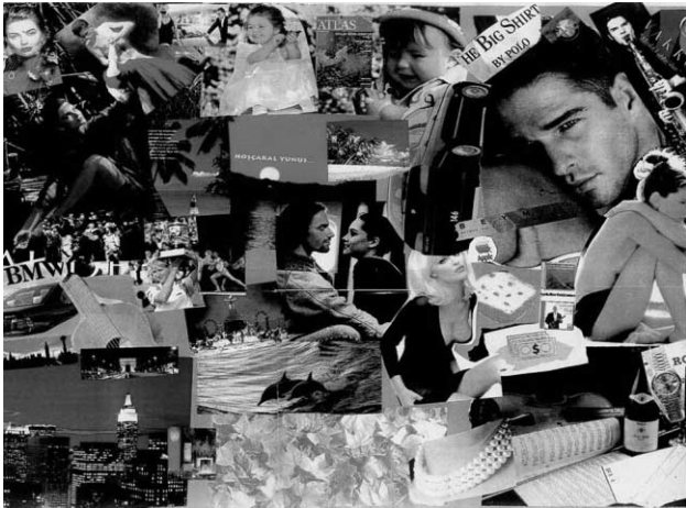
FIGURE 1 TURKISH FEMALE DESIRE COLLAGE

NOTE.—See the electronic edition of the journal for a color version of this figure.