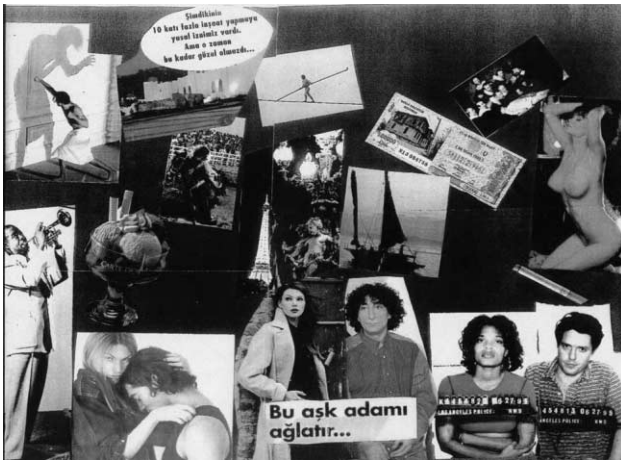
FIGURE 3 TURKISH MALE DESIRE COLLAGE

NOTE.—See the electronic edition of the journal for a color version of this figure.