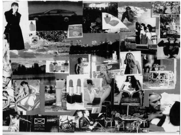
TURKISH FEMALE DESIRE COLLAGE

NOTE.—See the electronic edition of the journal for a color version of this figure.