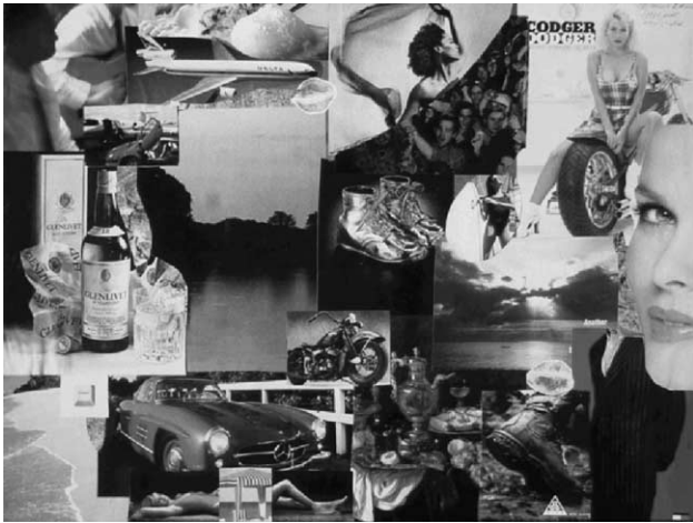
FIGURE 7 U.S. MALE DESIRE COLLAGE

NOTE.—See the electronic edition of the journal for a color version of this figure.