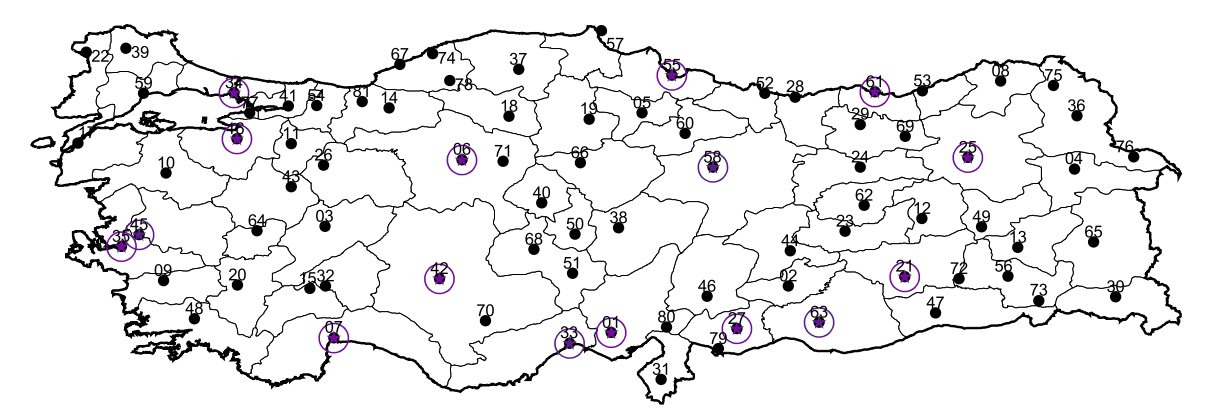
Fig. 1. The 81 demand nodes and the 16 candidate hub locations on the Turkish network.

Travel times using ground transportation are calculated assuming a travel speed of 80 km/h whereas travel times for using air transportation are estimated by assuming that the airplanes travel at a speed of 700 km/h. Since ground transportation can be used on the allocation links as well as on the hub links, we take \alpha_t^g = 0.9 as suggested by Tan and Kara [41]. On the other hand, since air transportation is available only between hub nodes, the air travel times correspond to their respective discounted values. Moreover, the unit operational costs and operational times are assumed to be embedded in the respective cost and time parameters.