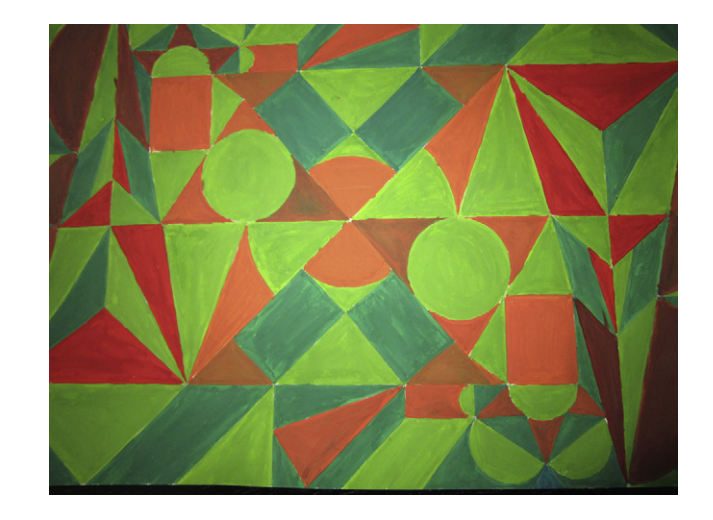
Figure 1 Artifact example (Factor 1 = 43 points; Factor 2 = 35 points and Factor 3 = 16 points).

elements and 10 items as the assembly of design elements were decided. Two experts within the field were asked to mark each item on a 5-point Likert scale (1 = poor; 2 = poor-average; 3 = average; 4 = average-excellent; 5 = excellent). Expert one has 32 years of experience in design discipline and involved with the creativity studies more than 20 years. Expert two has 10 years of experience in the design field and a well-trained rater. Besides having experienced raters, this study is based on the literature that reports the relevant scientific information for the calculation of a confidence interval for intra-class correlation to assess the inter-rater reliability of the studies (Shoukri, Asyali, & Donner, 2004). Since there were 210 first-year design students as subjects, two raters were providing an acceptable level of reliability for the assessment of the creativity tool. With the sample size of 210 and 2 raters, the variance of the estimated intra-class correlation coefficient was minimised.