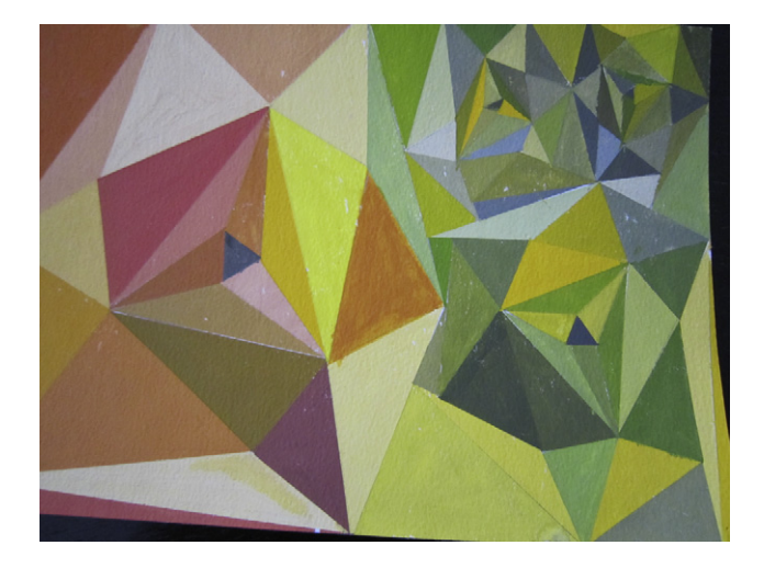
Figure 2 Artifact example (Factor 1 = 37 points; Factor 2 = 18 points and Factor 3 = 9 points).

elements and 10 items as the assembly of design elements were decided. Two experts within the field were asked to mark each item on a 5-point Likert scale (1 = poor; 2 = poor-average; 3 = average; 4 = average-excellent; 5 = excellent). Expert one has 32 years of experience in design discipline and involved with the creativity studies more than 20 years. Expert two has 10 years of experience in the design field and a well-trained rater. Besides having experienced raters, this study is based on the literature that reports the relevant scientific information for the calculation of a confidence interval for intra-class correlation to assess the inter-rater reliability of the studies (Shoukri, Asyali, & Donner, 2004). Since there were 210 first-year design students as subjects, two raters were providing an acceptable level of reliability for the assessment of the creativity tool. With the sample size of 210 and 2 raters, the variance of the estimated intra-class correlation coefficient was minimised.